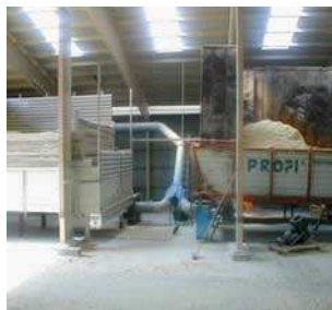
Feeding table for input to mill