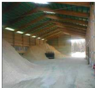
Barn for raw material