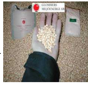
GME quality pellets comes in two sizes:

The GME pellet highly exceeds the limits for Class 1 Pellets according to Swedish Standard 187120