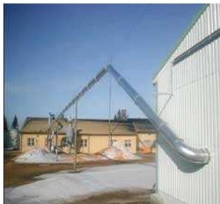
Feeding line to factory